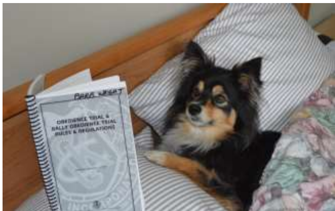
Riveting bedtime reading!